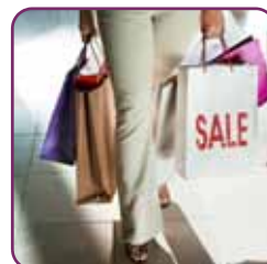
Shopping can help!