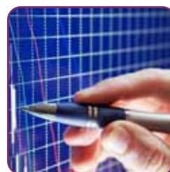
Turning a loss ...