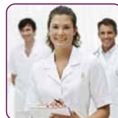
Protection in a recession