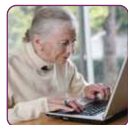
Working later in life?