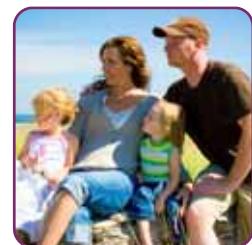
Family income benefit