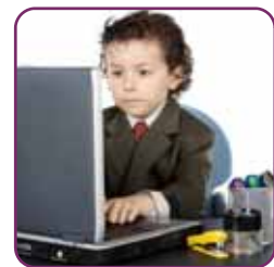
Helping future generations