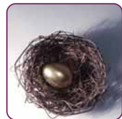
Increased ISA limits