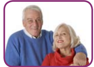
Later retirement looms