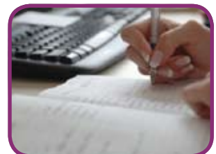
Self-certification to end