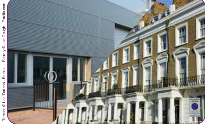
Terrace © Lee Torrains - Fotolia - Factory © Joe Gough - Fotolia.com

A more recent area that needs looking at is that if you use a wireless broadband connection, you must use password protection. If you do not, anyone can link in to your home network and not only ‘steal’ the internet access you are paying for, but also look at your files, banking details and other information, in order to defraud you.