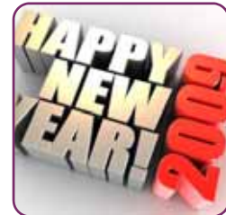
Things could be worse